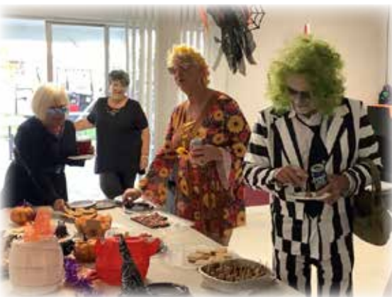
LOTS OF GOODIES TO CHOOSE FROM