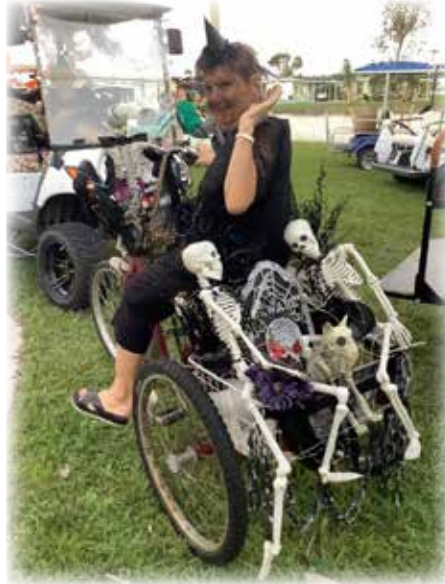
GOOD WITCH, JUDY