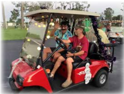
GROUCHO AND FRIEND