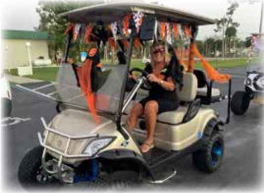
READY TO ROLL