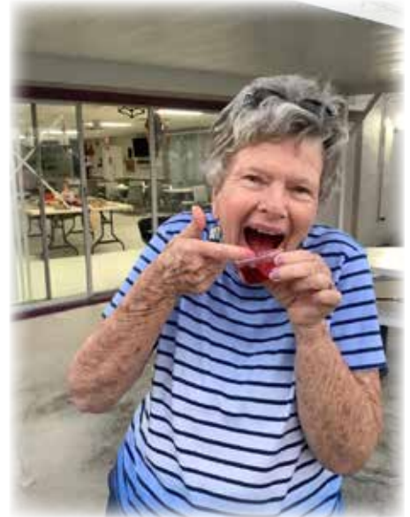
MMMM, THOSE JELLO SHOTS