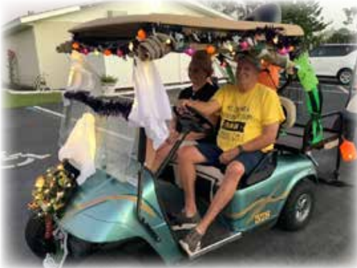
LOTS OF GHOSTS THAT NIGHT