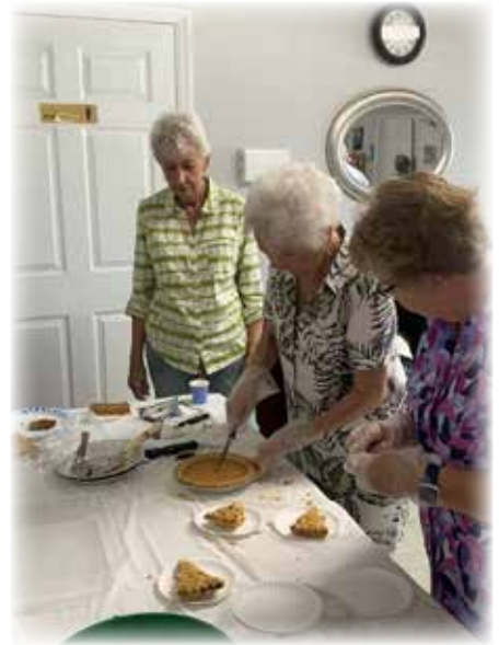
PUMPKIN PIE WAS THE WINNER