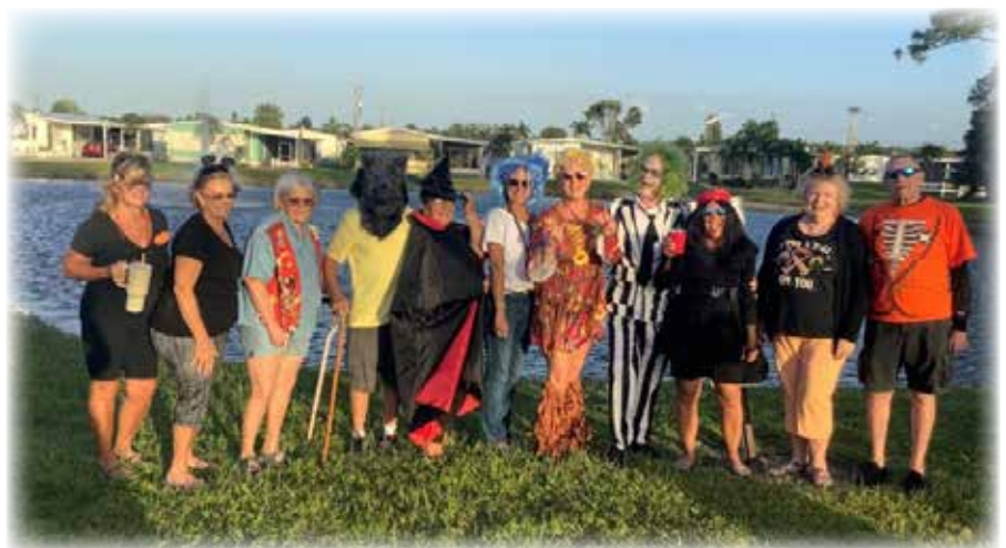
MORE WITCHES AND GOBLINS