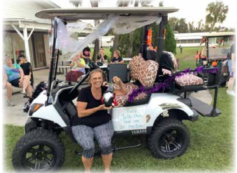
1ST PRIZE FOR DECORATIONS.....OR WAS IT THE JELLO SHOTS?